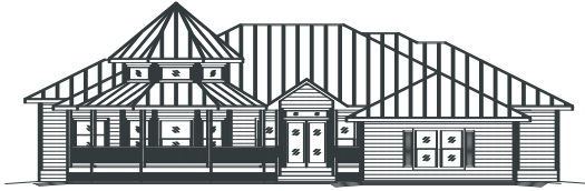
USEPPA - FRONT ELEVATION