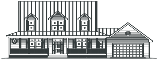
PLANTATION - FRONT ELEVATION