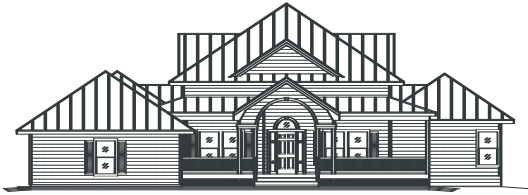
MARQUESAS - FRONT ELEVATION