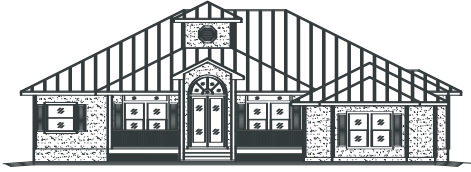
ISLAMORADA - FRONT ELEVATION