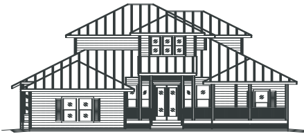
GASPARILLA - FRONT ELEVATION