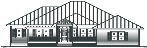
CHINO II - FRONT ELEVATION