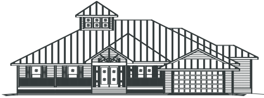
BISCAYNE - FRONT ELEVATION